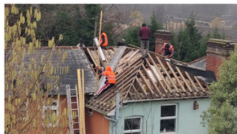
The workers had been renovating the roof of a property in Surrey.

Company and director sentenced for putting workers at risk while carrying out roof works - HSE Link